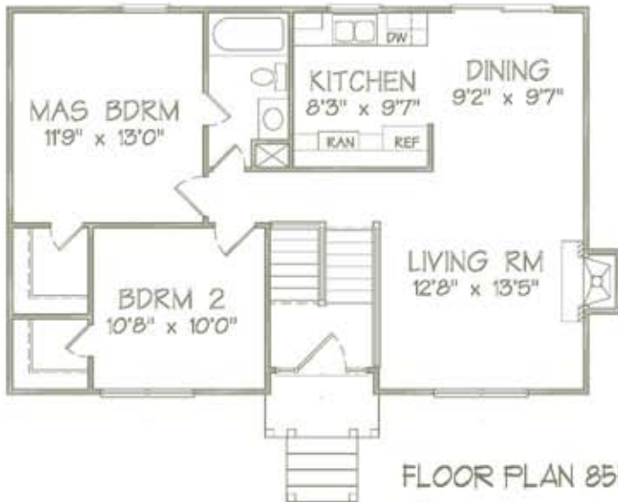
FLOOR PLAN 855 SQ FT