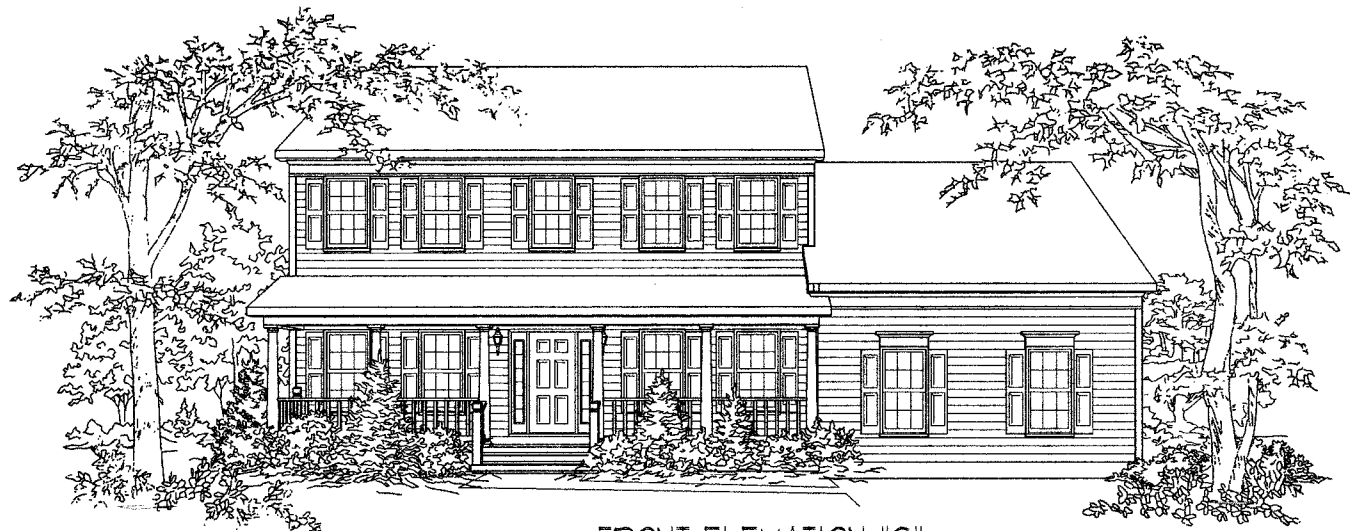
FRONT ELEVATION "C"